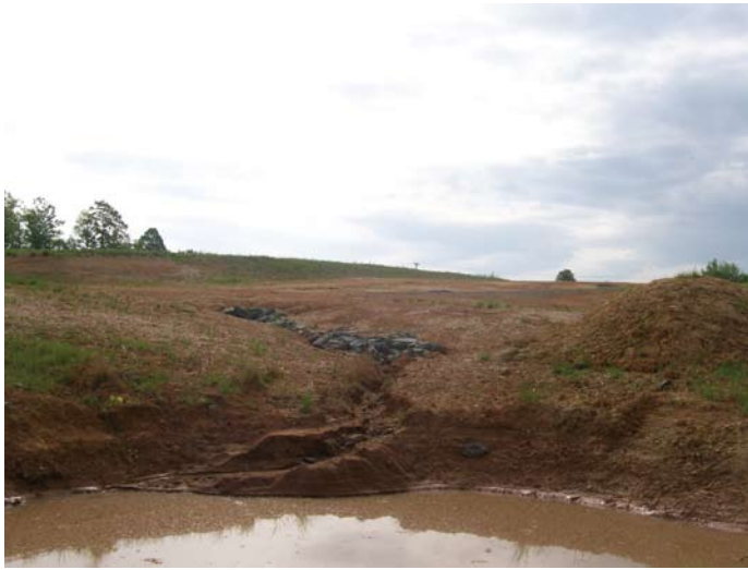
Construction sites generate much more sediment pollution than typical vegetated land.

waterways. We have also identified potential improvements to the County’s form contract for agreements-in-lieu-of-a-plan.