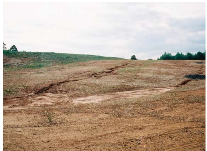
Under current law, occasional grading allows developers to avoid their obligation to stabilize denuded areas, like this site near Zion’s Crossroads.

Although the proffer solution worked in this case, a better solution would be to set an outer time limit for destabilization in the E&S ordinance itself. This would make the better standard applicable to all developments, not just those requiring rezoning. For this reason, Albemarle County amended its E&S ordinance in August 2009 to adopt a nine-month outer time limit for all sites requiring an E&S plan. The Albemarle ordinance includes a clear deadline but also incorporates flexibility for difficult sites by allowing for staff to grant a short (six-month) extension, or the Board of Supervisors a longer one, if certain criteria are met. 35 We recommend a similar change to Fluvanna’s E&S ordinance.