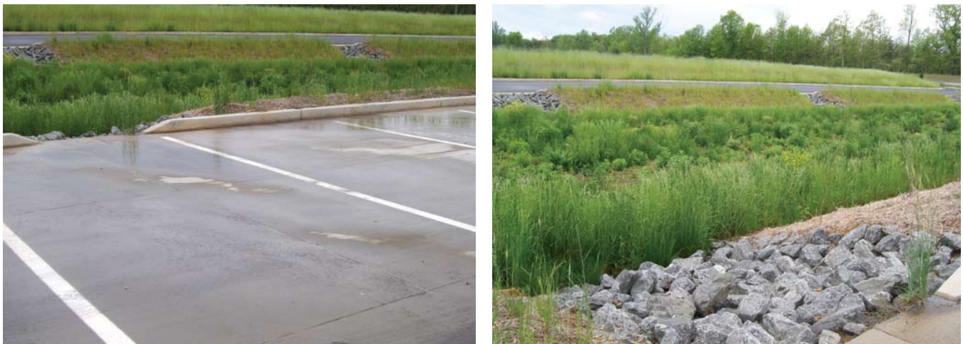
This parking lot in Greene County's Gateway development directs stormwater runoff into a bioswale.

Landscaping requirements for parking lots in Fluvanna County focus mainly on aesthetics, not stormwater management. Of particular note, the County does not require parking lots to contain a specified percentage of landscaping. Instead, it merely specifies dimensions for landscaped islands.