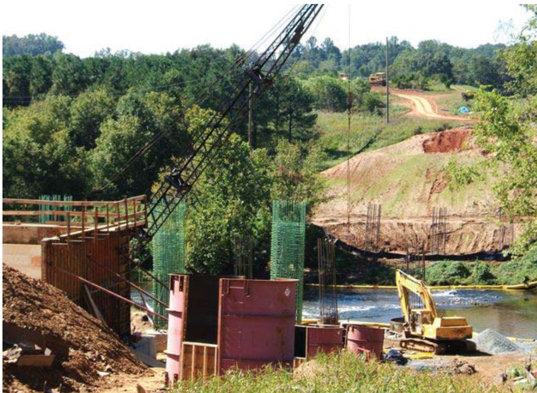
Construction of the new Rivanna Bridge at Palmyra 2006.

This report highlights a number of ways in which the County's ordinances and policies can be refined to foster management and development decisions that help protect local waterways. By removing unnecessary regulatory obstacles to smarter development patterns, strengthening water protections where loopholes currently exist, and providing stronger incentives for more sensitive land stewardship, Fluvanna County can ensure cleaner and healthier rivers and streams for its current and future residents.