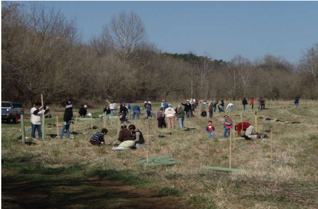
Volunteers planting riparian tree buffers.

riparian areas in connection with new development. A variety of land use activities affect stream buffers in Fluvanna County, including agriculture, forestry, and development. Although riparian buffers protection for new development is just one piece of the puzzle, it is an important and timely piece.