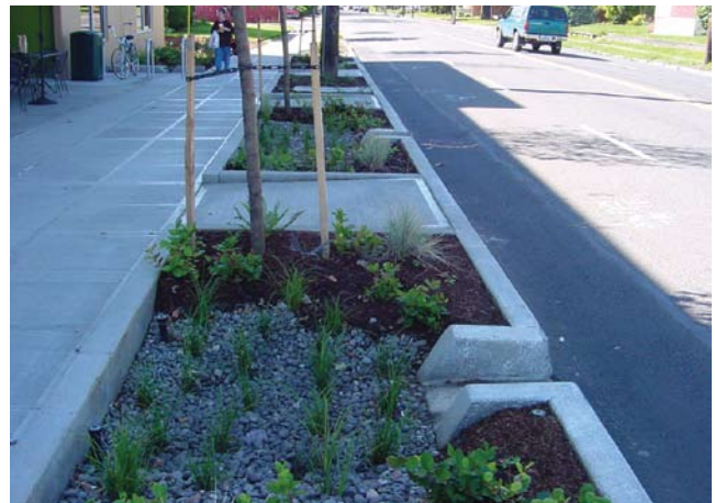
Periodic curb cuts allow for streetside infiltration of stormwater, reducing the amount of runoff that enters storm sewers.

Conventional curb and gutter systems collect all the stormwater runoff from the roadbed and channel it directly to the storm sewer system. However, in appropriate circumstances, roadside curbs can be “perforated” with periodic cuts which divert runoff into planting strips and other vegetated areas, thus helping to slow, filter, and absorb it. Also, as with landscaped areas in parking lots, “back-up” drainage features can be used to address potential overflow during unusually heavy storms.