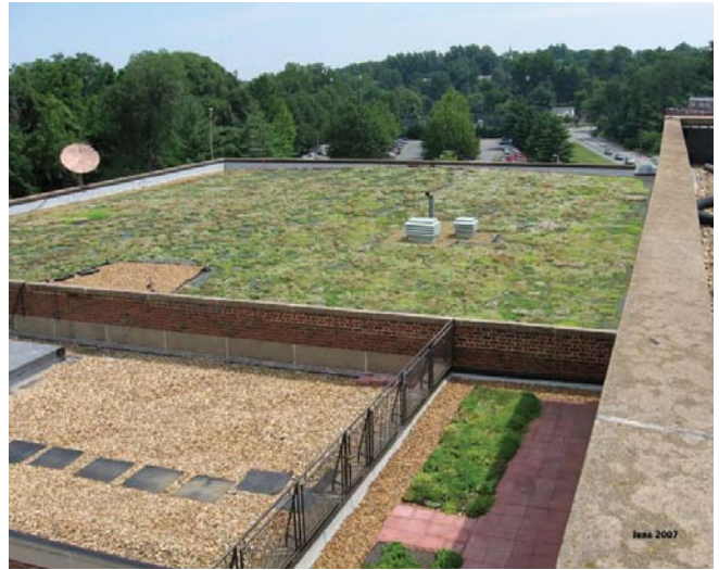
Green roofs, such as this one for Albemarle County's office building, represent one possible LID measure Fluvanna can encourage.