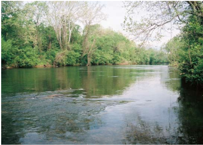
The Rivanna River is a vital resource for Fluvanna County and must be protected.

The intent of this report is to identify a few key ways in which Fluvanna County can protect its waters from stormwater pollution, consistent with its vision to be one of the most livable and sustainable communities in the United States. The County’s Comprehensive Plan outlines a means by which Fluvanna can accommodate anticipated growth while sustaining its rural, “small town” character. 1 The Comprehensive Plan includes, in its twenty-year vision, a goal that the County’s rivers be “healthy and full of life.” 2 The Plan also declares