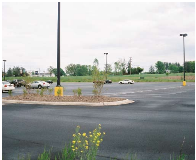
Parking lots are one of the most significant sources of concentrated stormwater runoff.

Requiring that an appropriate percentage of parking spaces within large parking lots be designed to “compact” dimensions can reduce the size of the parking lot while accommodating